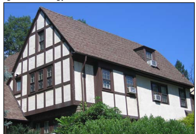
Historic, wood double-hung sash windows with modern storm windows in Wyncote.

When the windows in your house are structurally compromised or deteriorated, an intervention level exceeding quick fixes such as caulk or weather stripping may be necessary. Window repairs may