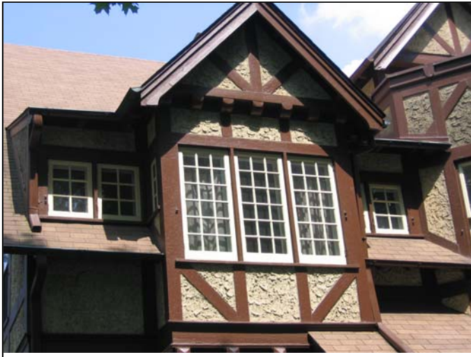
Historic, wood casement windows in the Wyncote Historic District.

building is through the windows, and that windows account for only 25% of the heat loss. An analysis of the air infiltration patterns and rates, the U-factor (the rate at which glazing conducts non-solar heat flow), and the solar heat gain coefficient of your windows shows that properly functioning, historic wood windows with low-emissivity storm windows and standard window treatments are nearly as efficient as modern replacement windows, with the added advantage of already-expended energy in their manufacture and installation. It is also important to note for those concerned with sustainability/green issues that retaining existing building materials, where reasonable, reduces both the landfill space dedicated to storing discarded building materials and the environmental impacts associated with manufacturing and transporting new materials.