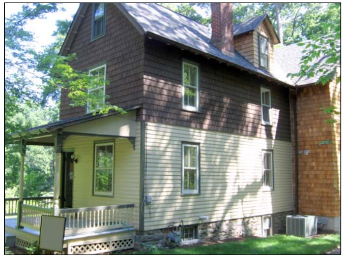
The historic wood windows on this property were repaired and storm windows were installed.

CHRS, Inc., of North Wales, Pennsylvania prepared this publication.