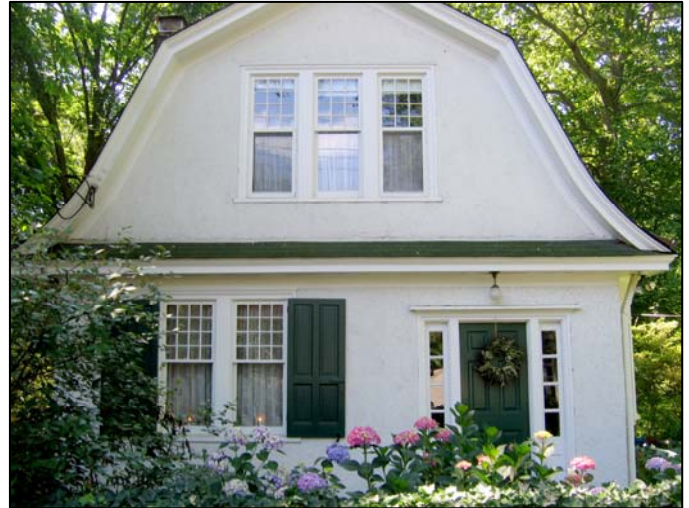
This dwelling in Wyncote has properly maintained, historic, wood, double-hung sash windows with operational shutters.

After historic windows have been properly repaired, their performance in terms of energy efficiency increases. Combined with storm windows, properly repaired historic windows have the dual benefit of longevity (in some cases more than 200 years) and can virtually meet the performance of modern replacement windows, which have a much shorter lifespan.