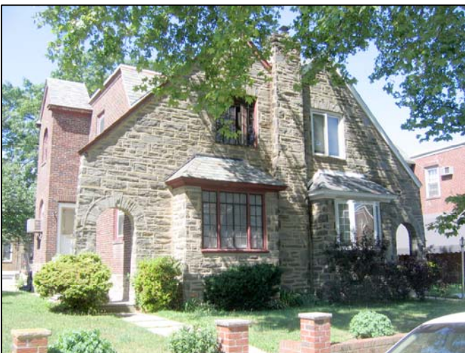
These semi-attached dwellings in the La Mott Historic District illustrate the role that windows play in the appearance of a building. The dwelling on the left has the original steel casement windows, whereas the one of the right has modern vinyl windows.

A list of contractors who specialize in the repair of historic wood in the greater Philadelphia region is available in Cheltenham Township's Building and Zoning Department. You may reach the office at 215-887-1000, extension 213.