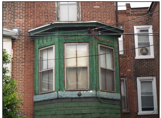
Windows in poor condition require intervention to maximize your home's energy efficiency.

The ratio between the SHGC and VT. It provides a gauge of the relative efficiency of different glass or glazing types in transmitting daylight while blocking heat gains. The higher the number, the more light transmitted without adding excessive amounts of heat. This energy performance rating is not always provided.