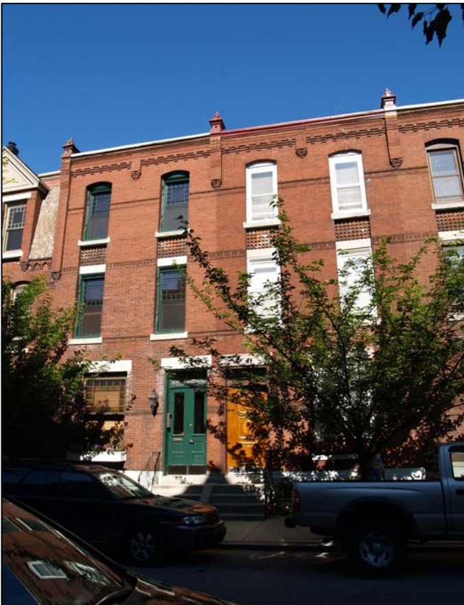
Replacement windows can alter the overall appearance of historic buildings, as illustrated in these row houses. The fiberglass windows on the left mirror the original Queen Anne configuration and maintain a narrow frame profile. The vinyl windows on the right are less sympathetic to the original design of the building.