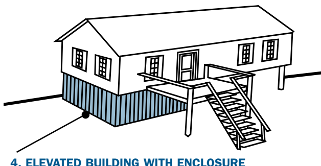
4. ELEVATED BUILDING WITH ENCLOSURE

Coverage limitations apply to the enclosed areas (lower floor) even when a building is constructed with what is sometimes called a “walkout basement.”