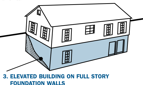
3. ELEVATED BUILDING ON FULL STORY FOUNDATION WALLS

When a building is elevated on foundation walls, coverage limitations apply to the “crawlspace” below.